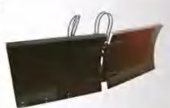
v snow blade