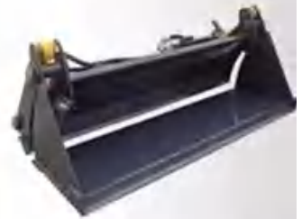
4 in 1 bucket