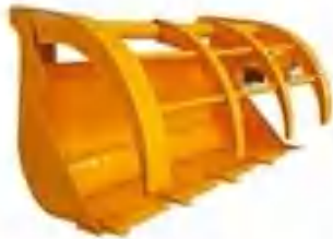
2 in 1 bucket